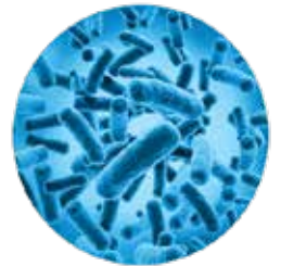
COMPETITIVE FLOOR FINISH

*Images shown are simulations representative of typical bioburden counts on treated and untreated surfaces.