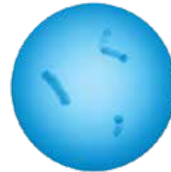
CLARION 25 AND ARENA 300 WITH MICROBAN